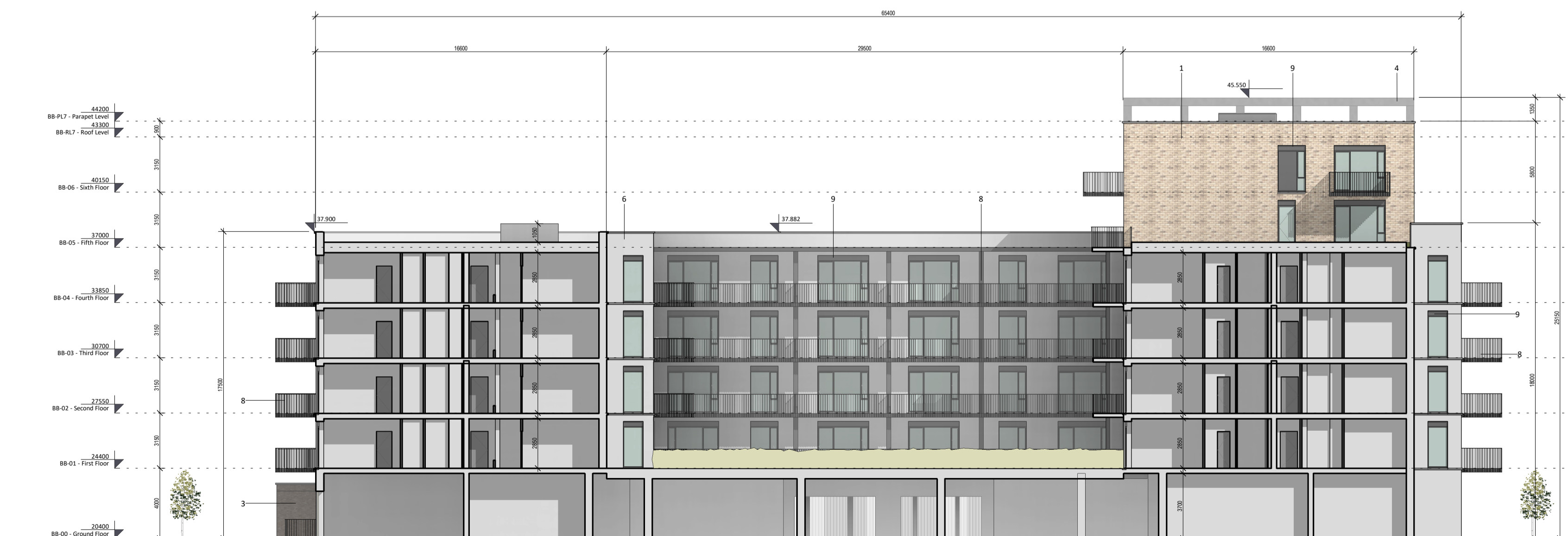
3 BB-West Section/Elevation through Courtyard 1:200

o'mahony pike architecture | urban design email: info@omahonypike.com tel: +353 1 202 7400 fax: +353 1 283 0822 www.omahonypike.com Dublin The Chapel Mount St. Anne's Milltown, Dublin 6 D06 XN52 Ireland Cork 26 South Mall Cork City Co. Cork T12 R2RV Ireland Project No.: 1618 Project Lead: SD Drawn By: TT Model No.: 1618-OMP-00-M3-A-0001 Purpose: Planning Scale @ A1: 1:200 Date Printed: 09.10.2019 Current Rev.: 1 Status: S0